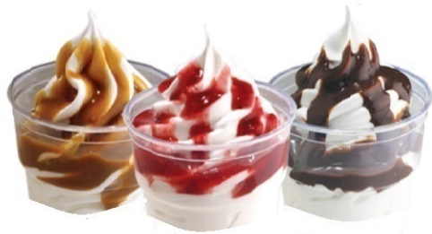
Pasmo S 920 T auto